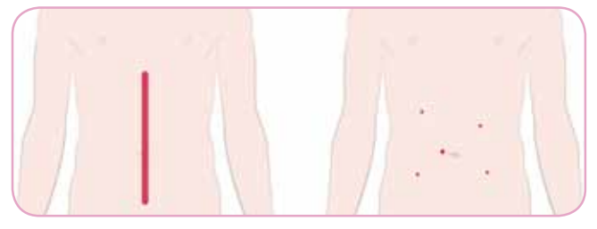
Open Colorectal Cancer Surgery Incision

Laparoscopic surgery is a minimally invasive alternative to open surgery. However, this approach is considered to be technically challenging due to the extensive dissection required, along with the limitations of traditional laparoscopic technology.